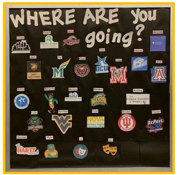
Class of 2022's Board Highlights Student Plans Ranging from West Point to Gap Years.

As students begin to finalize their plans, they'll have the opportunity to share that with our MTAS community via our "Where Are You Going?" board. It serves as a decorative centerpiece of our classroom. So, as YOU begin to make those final decisions, be sure you communicate your commitment so we could spread the work and celebrate your success!